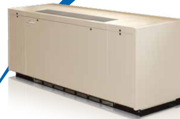
VALEDICTORIAN™ UNDER-THE-WINDOW VERTICAL UNIT VENTILATOR