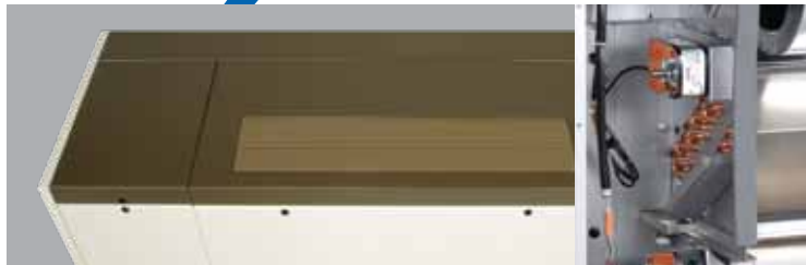
14-Gauge cabinets with pencil-proof clear anodized aluminum bar grilles are available in a variety of one or two-tone colors.